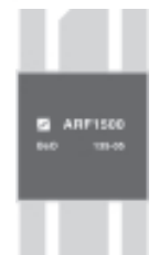
Figure 4 T1-Pack