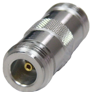
Type N Female to Type N Female Low-PIM Adapter