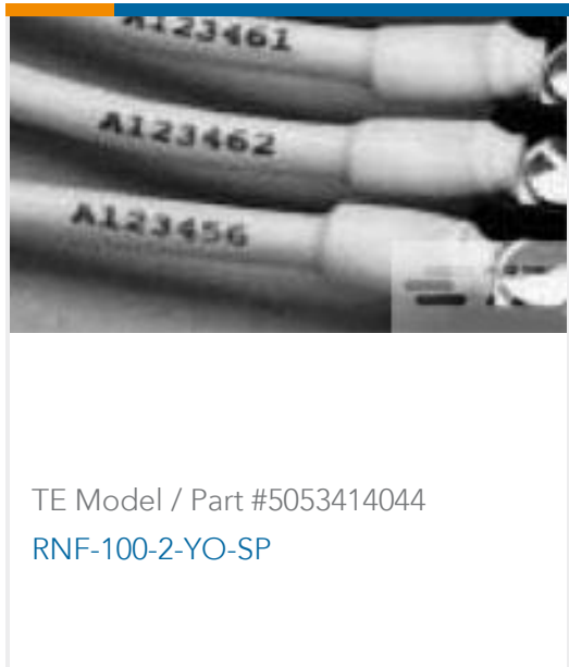
TE Model / Part #5053414044 RNF-100-2-YO-SP