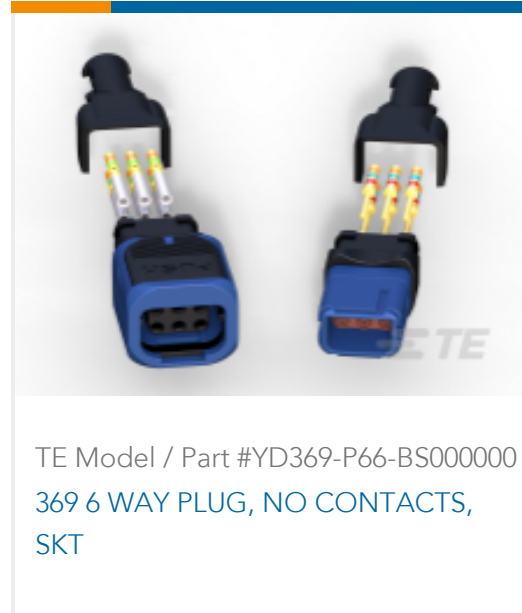
TE Model / Part #YD369-P66-BS000000 369 6 WAY PLUG, NO CONTACTS, SKT