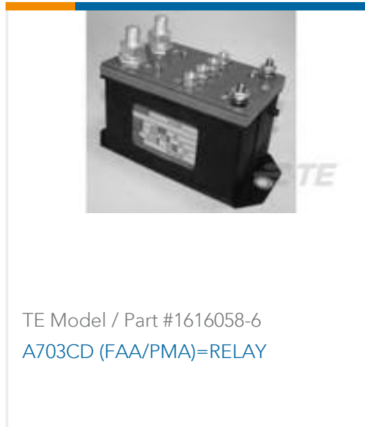
TE Model / Part #1616058-6 A703CD (FAA/PMA)=RELAY