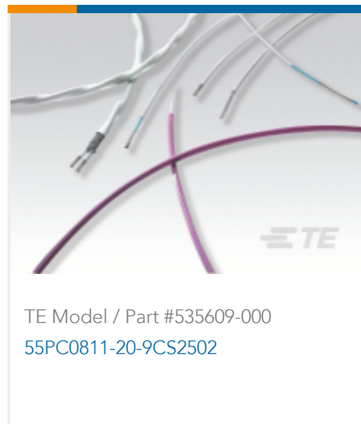
TE Model / Part #535609-000 55PC0811-20-9CS2502