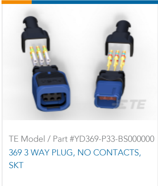
TE Model / Part #YD369-P33-BS000000 369 3 WAY PLUG, NO CONTACTS, SKT