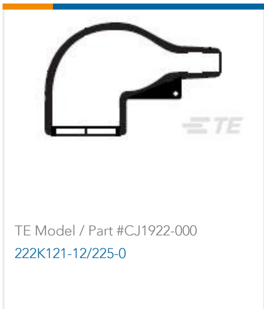
TE Model / Part #CJ1922-000 222K121-12/225-0