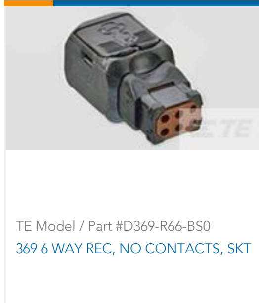
TE Model / Part #D369-R66-BS0 369 6 WAY REC, NO CONTACTS, SKT