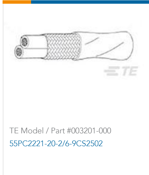
TE Model / Part #003201-000 55PC2221-20-2/6-9CS2502