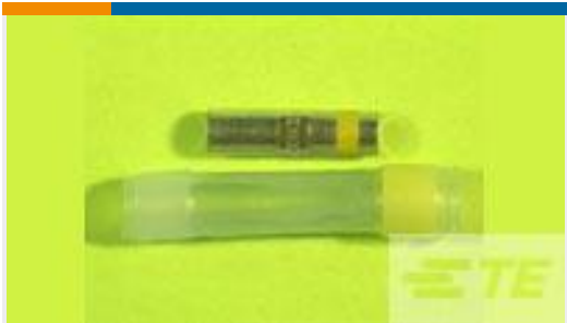
TE Model / Part # 650075-000 D-436-37