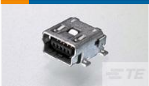
TE Model / Part #1734035-1 MINI USB, TYPE B, R/A, SMT