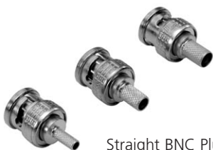
Straight BNC Plug Connectors