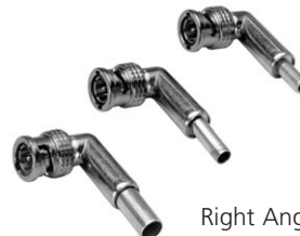
Right Angle BNC Plug Connectors