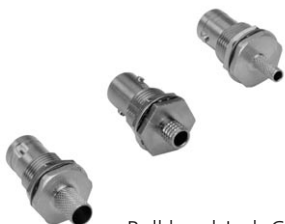
Bulkhead Jack Connectors