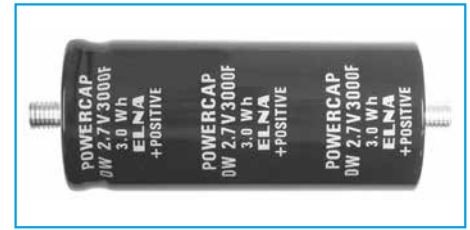
Marking color : White print on a black sleeve