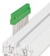
The figure shows a 12-position version

Please be informed that the data shown in this PDF Document is generated from our Online Catalog. Please find the complete data in the user's documentation. Our General Terms of Use for Downloads are valid ( http://phoenixcontact.com/download )