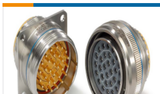
TE Model / Part #ZPF000000000121590 983-6SE 14-04 SY