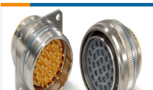
TE Model / Part #ZPF000000000037019 983-6SE 18-08 P6