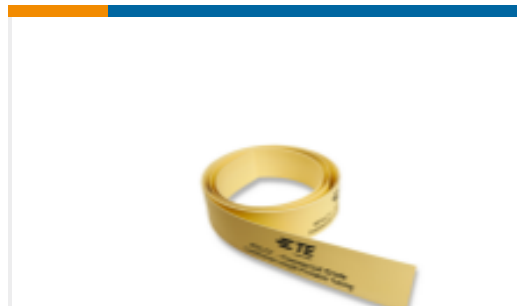
TE Model / Part #EL7602-000 CONTINUOUS TUBE COMMERCIAL GRADE RPS-CT