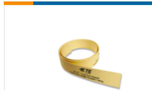
TE Model / Part #EL8195-000 CONTINUOUS TUBE LOW FIRE HAZARD HX-CT