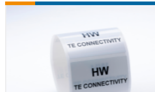
TE Model / Part #A47011-000 HW HIGH TACK WHITE POLYESTER LABELS