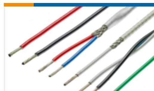
TE Model / Part #711371-000 44AM1151-20-MST5-9CS2275