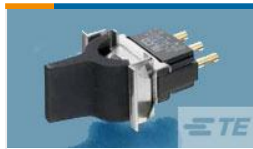
TE Model / Part #3-6437630-7 FLN19BLACK04=LEVER ACTION SWITCH