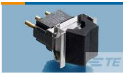
TE Model / Part #2-6437630-9 FLD29BLACK04=ROCKER ACTION SWITCH