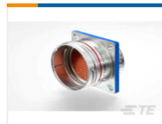
TE Model / Part #DG1230R22-61S3 RECP ASSY