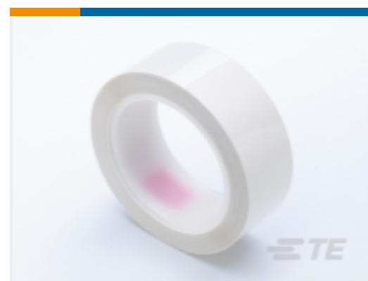
TE Model / Part #583910-000 NPVF COLOR CODING FLAGGING PVF LABELS