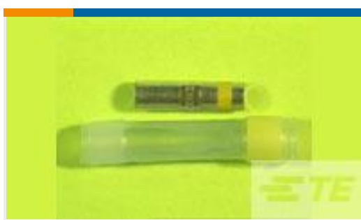
TE Model / Part # 650076-000 D-436-38