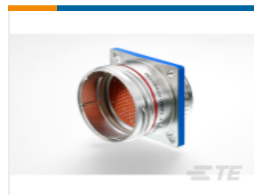
TE Model / Part #DG1230R20-45P3 RECP ASSY