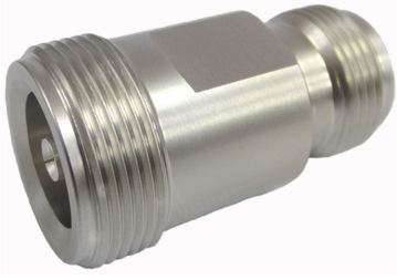
Type N Female to 4.1-9.5 DIN Female Adapter