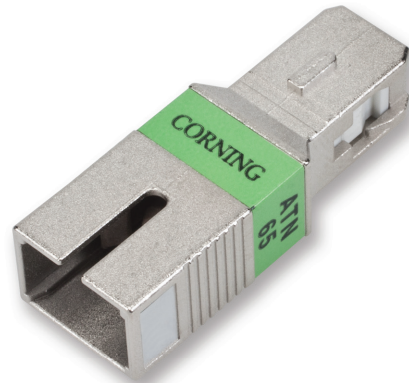
Part Number: ATN-65-09