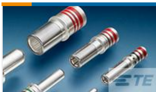
TE Model / Part # 0662-207-0882 CONT SOC ASSY