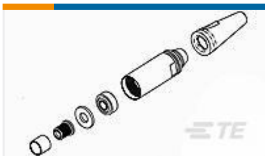
TE Model / Part #1828700-1 CBL ADPT,PRO BEAM MINI PLUG 5.0 AL EPDM