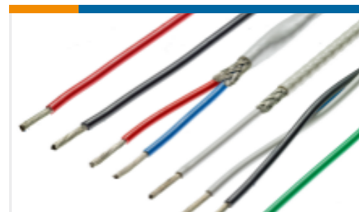
TE Model / Part #386921-000 44A0121-22-9/98