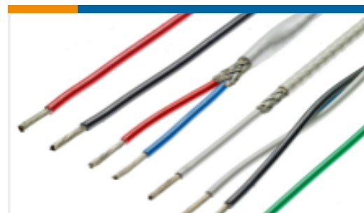
TE Model / Part #EG7274-000 44A0121-22-9/906