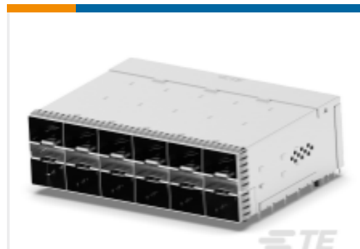
TE Part #3-2198339-1 zSFP+ STACKED 2X6 RECEPTACLE ASSEMBLY