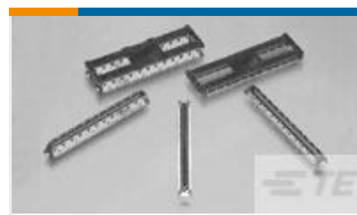
TE Part #3-5353652-6 .5FHP08H,440,B,GIG,08/Sn,HT,NSYes