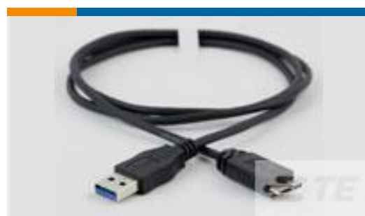
TE Part # 1-2117155-0 C/A, USB3.0 A TYPE TO MICRO B,