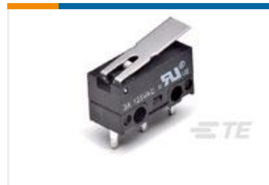
TE Part #2-1825043-0 UP3DTBNLB04,MICROSWITCH,SNAP