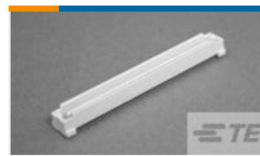
TE Part #5177984-4 0.8FH,P05H.5,100,08/Sn,TU