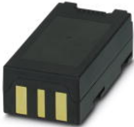
Rechargeable battery for operating the THERMOFOX printer

Please be informed that the data shown in this PDF Document is generated from our Online Catalog. Please find the complete data in the user's documentation. Our General Terms of Use for Downloads are valid ( http://phoenixcontact.com/download )