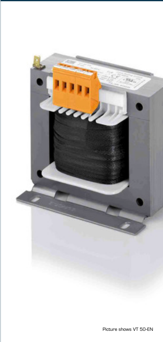
Picture shows VT 50-EN