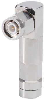
TNC Male Right Angle for 1/4 in LDF1-50 cable