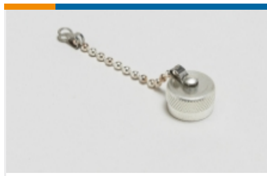
RF Connector Caps(1)