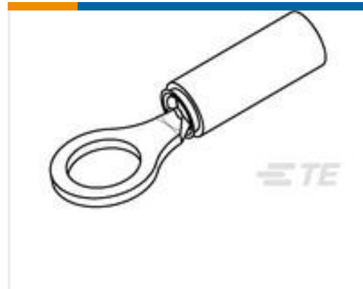
TE Part #1577621-1 TERMINAL RT PIDG PEEK STRATO 24-22 AWG