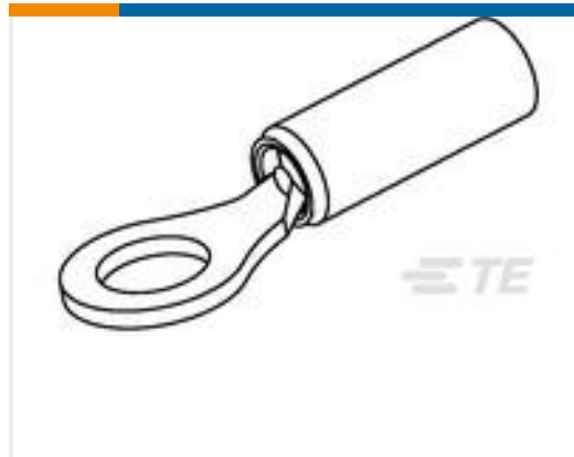
TE Part #1577623-1 TERMINAL, PEEK PIDG STRATO, 20AWG