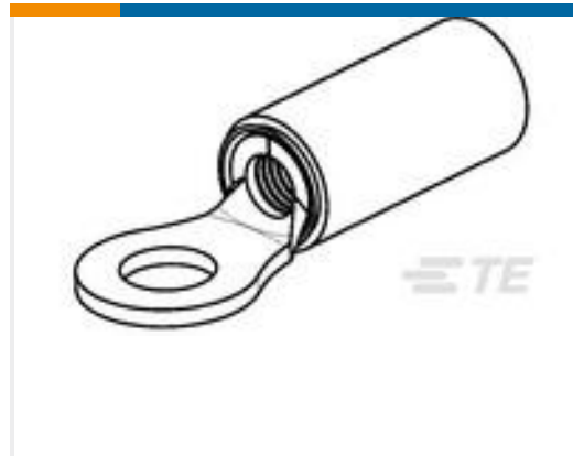
TE Part #1577647-1 TERMINAL RT PIDG PEEK STRATO 10 AWG