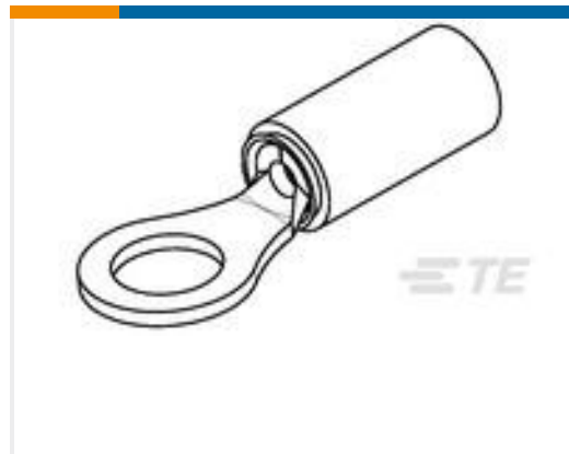
TE Part #1577633-1 TERMINAL RT PIDG PEEK STRATO 18-16 AWG