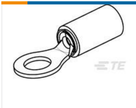
TE Part #1577640-1 TERMINAL RT PIDG PEEK STRATO 14-12 AWG