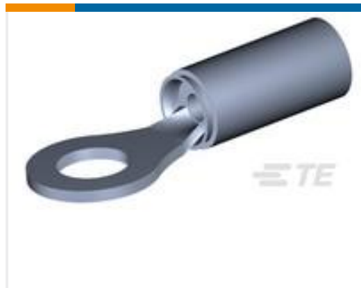
TE Part #1577632-1 TERMINAL RT PIDG PEEK STRATO 18-16 AWG