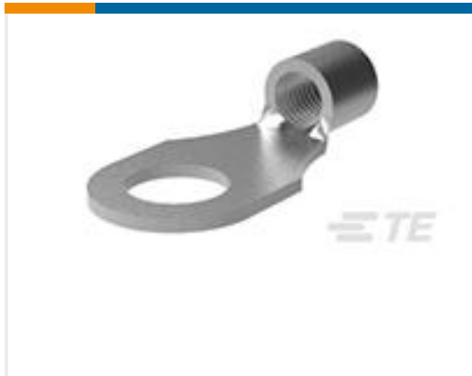
TE Part #134462-1 TERM, RING, STRAT, HR, SOLIS, 2, M6 (1/4)