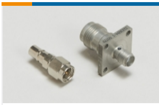
Between Series Adapters(1)